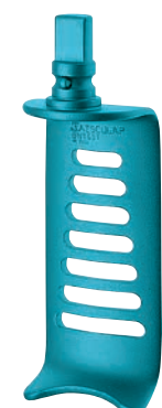
cranial-caudal blades (blunt)