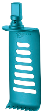
lateral blades (small teeth)