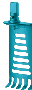
medial blades (large teeth)