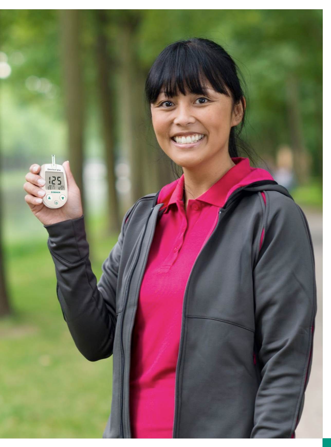
Omnitest® plus BLOOD GLUCOSE MONITORING SYSTEM